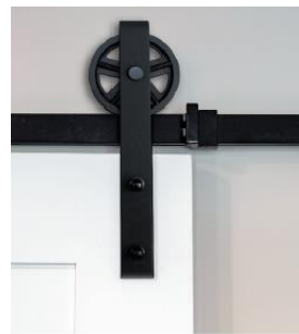
INDUSTRIAL TRACK HABARNINBK