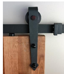
MEDIEVAL TRACK HABARNMEBK