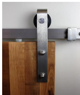
CLASSIC STAINLESS HABARNCLSS