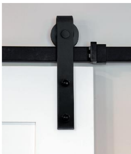
CLASSIC BLACK HABARNCLBK