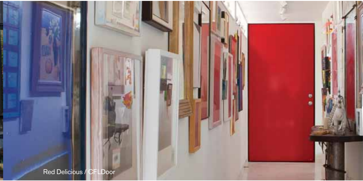
Red Delicious / CFL Door