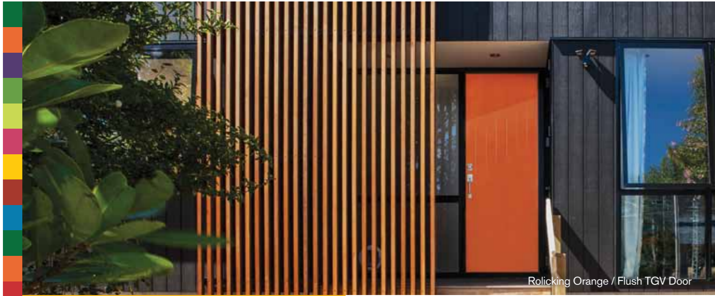
Rolling Orange / Flush TGV Door